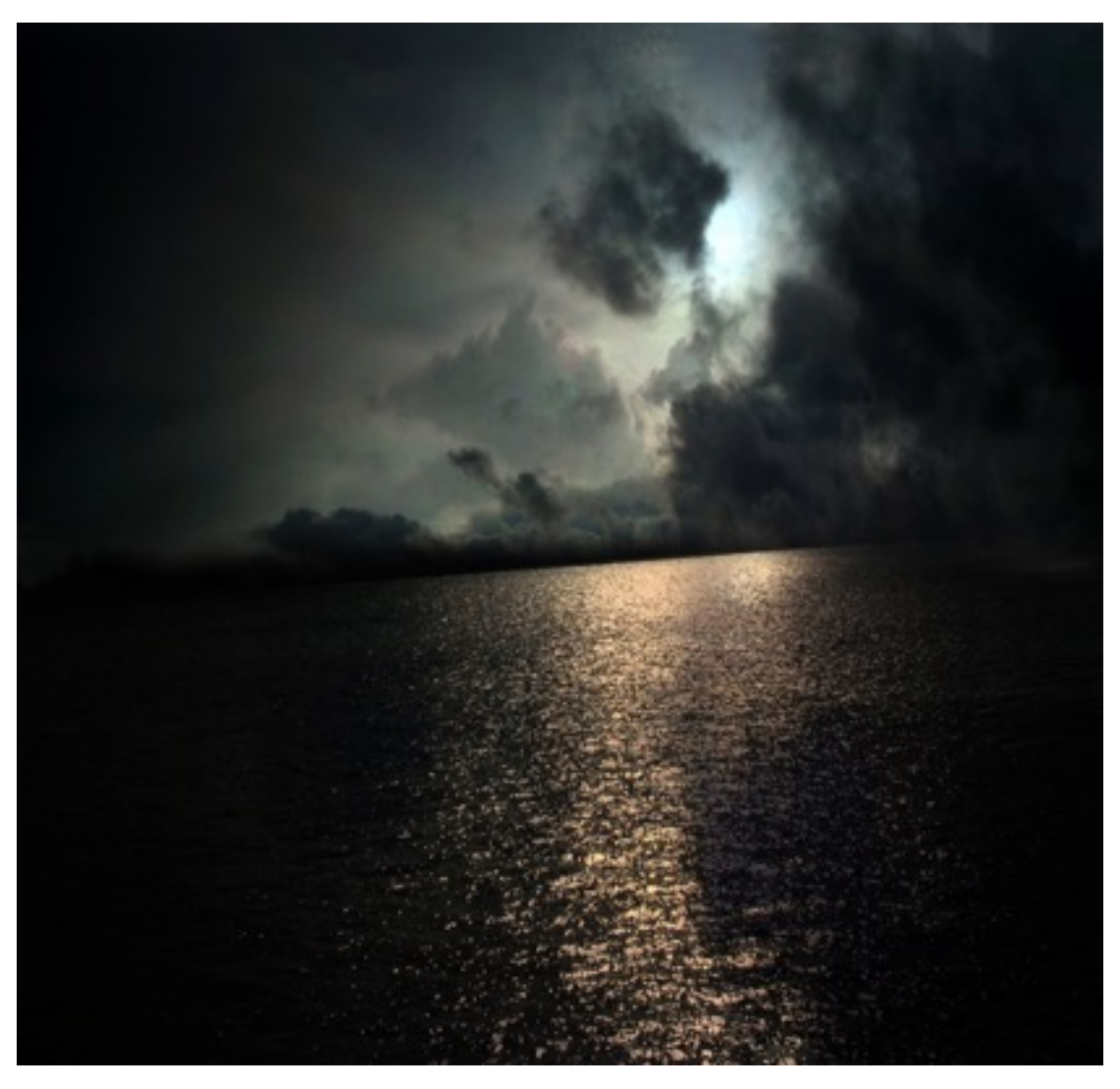
Sophia Szilagyi vision II (2009) pigment print, 54.7 x 57 cm

This exhibition sees Szilagyi also investigate the nature of physical vision. In many works objects slide in and out of focus, with some edges clear and others blurred. The horizon is off kilter in vision II , throwing us off balance and forcing the viewer into an unsteady perspective. In some prints Szilagyi layers the opaque imprint of one scene over another, building up the complexity of the image. This is subtly rendered in a matter of the skies where the faint outline of trees can be just discerned in the large mass of blue/grey sky. It's as if one's eyes have moved too quickly upward from the trees below, bringing the image of them still imprinted on the retina, to the view of sky above.