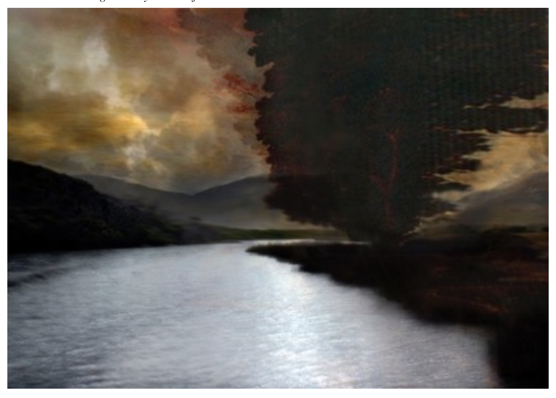
Sophia Szilagyi nature hesitate (2009) pigment print, 140 x 200 cm

In 2009 Sophia Szilagyi created a memorable exhibition titled 'Darkness Visible'. Drawing heavily on photographic sources, Szilagyi's masterful manipulations within the medium of digital printmaking turn reality on its head – creating works that are as unnerving and unsettling as they are seductive. Here is the catalogue essay I wrote for her show.